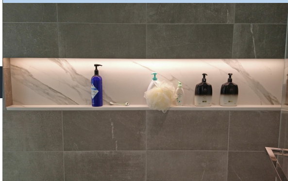
Shower Niche Lighting using Wet Rated Micro

Black (b) - appears black when not lit, best for areas where de-emphasizing the lens is desired. (Reduces light output).