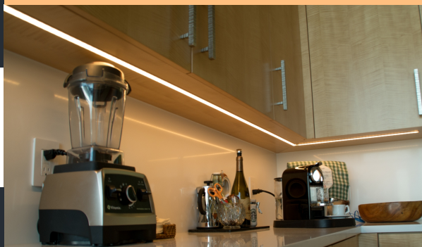
Under Cabinet Lighting using Recessed Micro